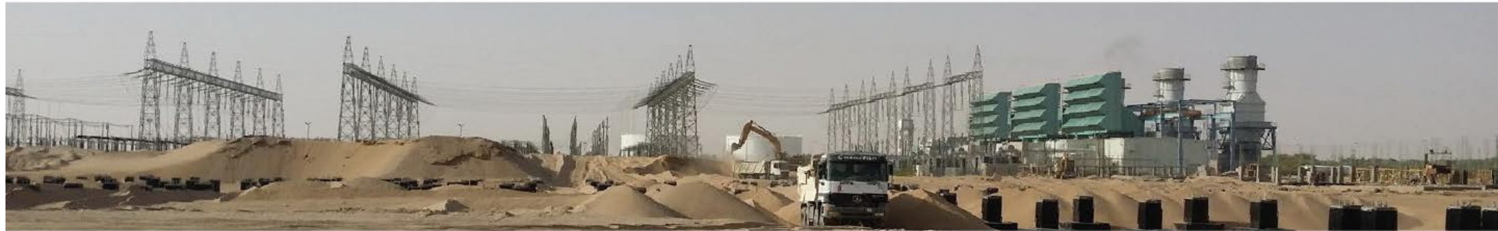
Gas powered 400 MV power plant built by Siemens / BemcoJV in Safer area