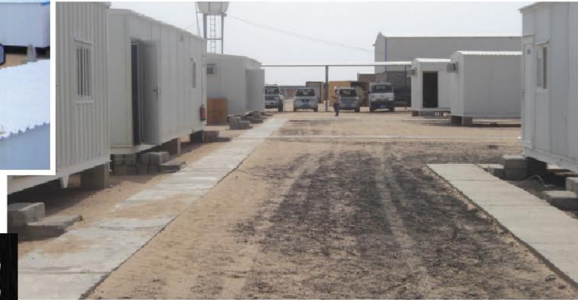
Marib Base with high standard Accommodation