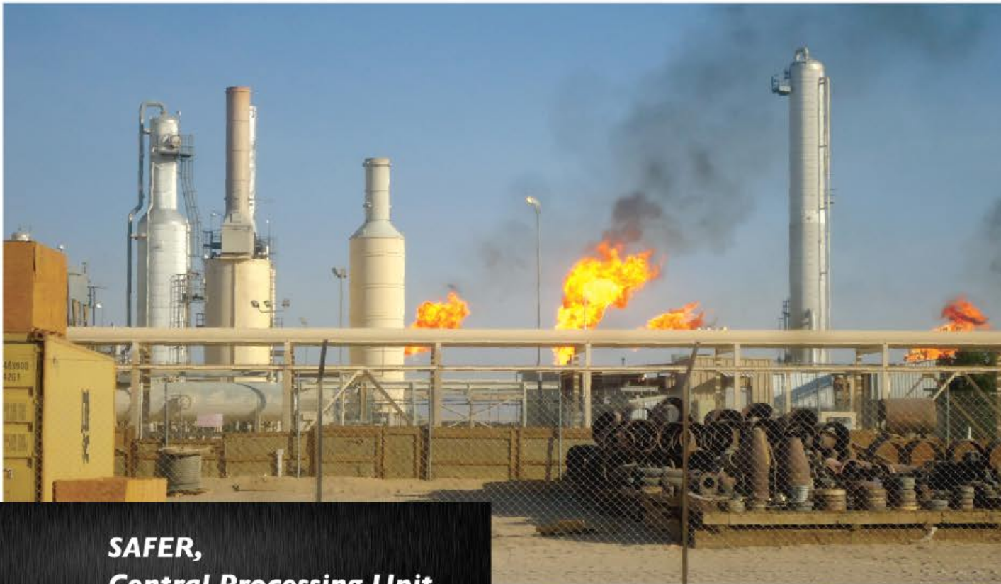
SAFER, Central Processing Unit